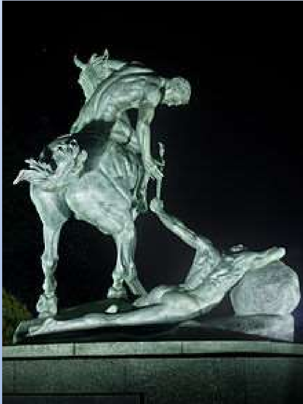
Los portadores de la antorcha (The Torch-Bearers) –